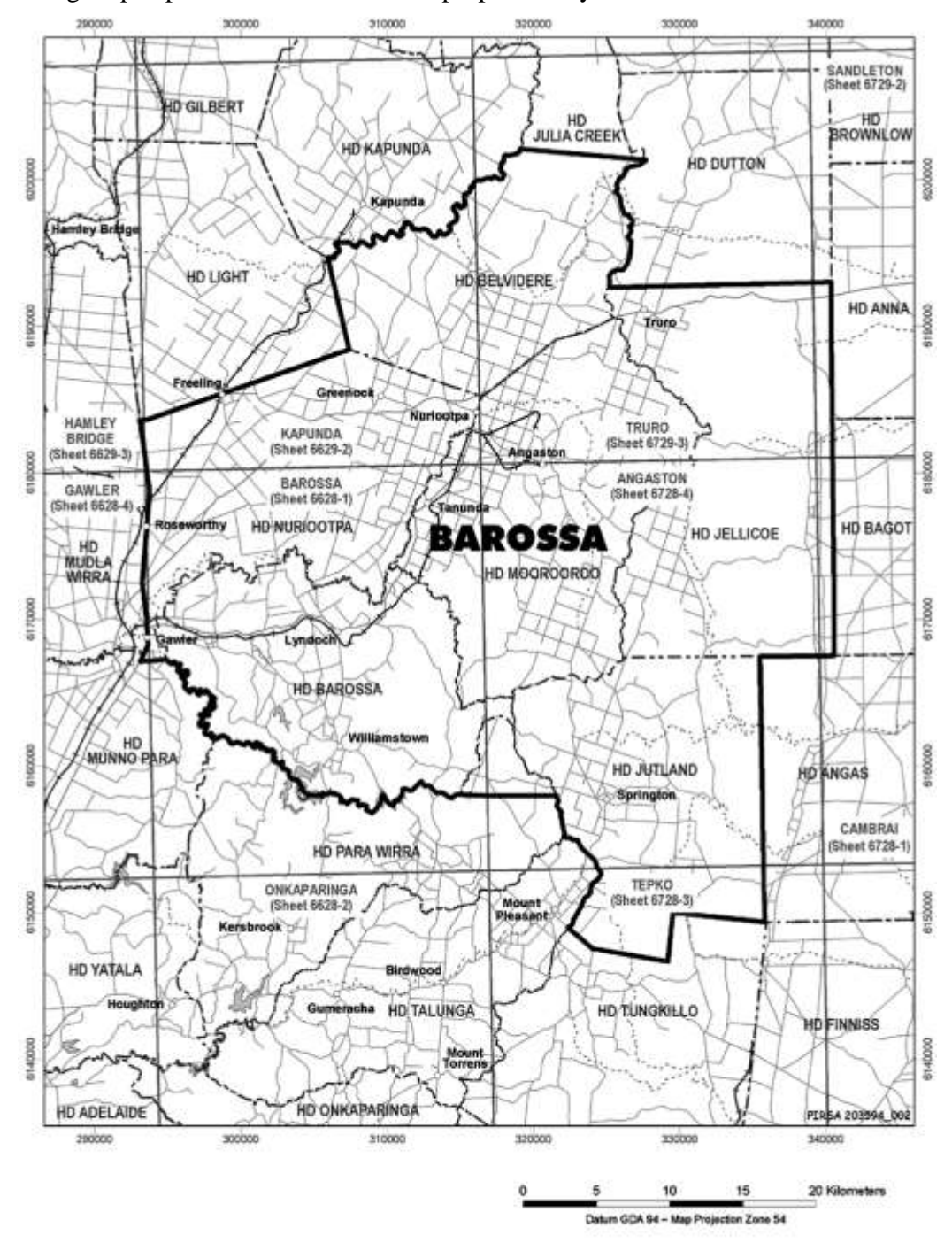
The Geographical Indication "Barossa"

The following map is provided for information purposes only.