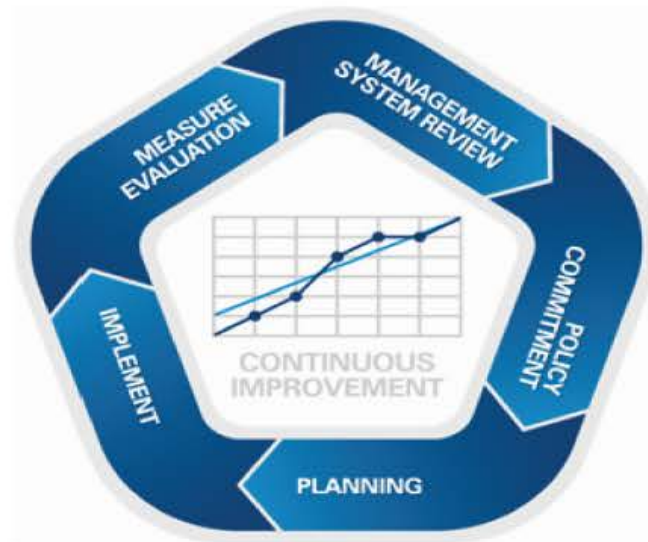
Diagram 1 –Continuous improvement model

**Unless otherwise stated the element requirements apply to all disciplines ie, WHS, rehabilitation and claims.