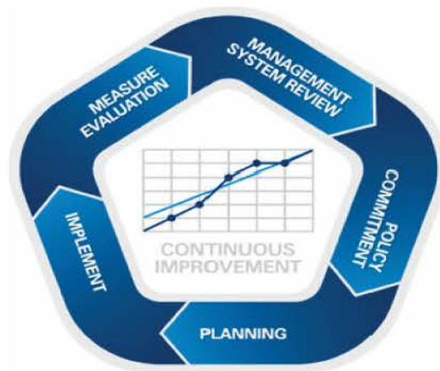
Diagram 1 –Continuous improvement model

**Unless otherwise stated the element requirements apply to all disciplines ie, WHS, rehabilitation and claims.